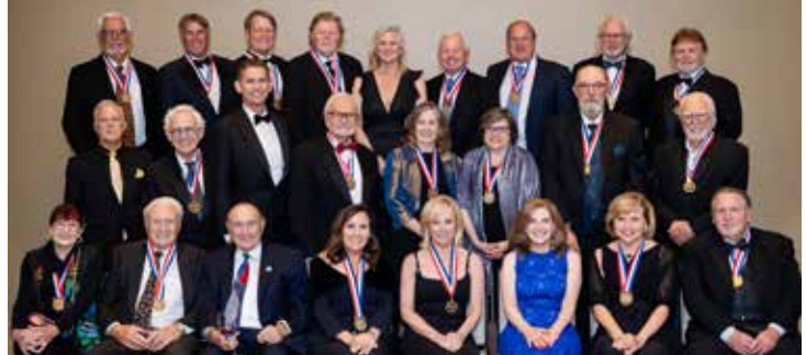
2024 Hall of Fame VIP Reception

2025 INDUCTEES WILL BE ANNOUNCED IN OCTOBER 2024